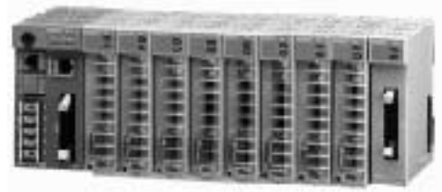
SR Mini HG System